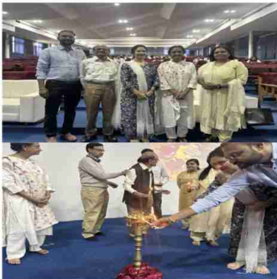
Inauguration and Opening Remarks Prayer